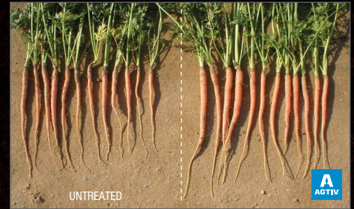
Bigger and straighter carrots on the right with AGTIV® and improved uniformity of carrots.