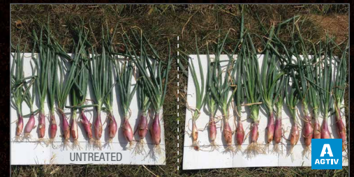
More developed root system on the right, and plants are larger with AGTIV®.