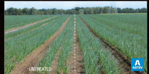
Onion split field with AGTIV® vs untreated. Plant growth and health is enhanced on the right.