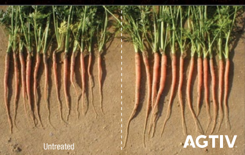
Bigger and straighter carrots on the right with AGTIV and improved uniformity of carrots.